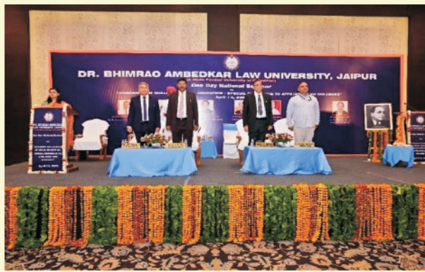
Glimpses of the Inaugural Session