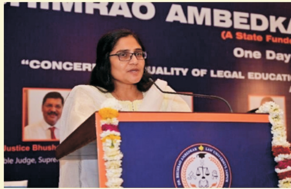
Smt. Shuchi Tyagi, (Commissioner, College Education of Rajasthan) Panelist, Panel Discussion Session.