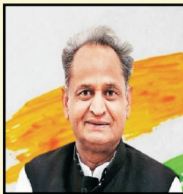
Hon'ble Sh. Ashok Gehlot, Chief Minister of Rajasthan

Shri Ashok Gehlot stated that the true and real meaning of imparting quality legal education invariably rests upon the regular and practical classes run by the well-equipped faculty. Since it was the 131 st birth anniversary of Dr. Bhimrao Ambedkar, expressing his views, Chief Minister in the simplest way but in depth expressed that our Constitution warrants the rule of law and any act of the Government taken in contrary to the procedure established by law cannot be called under the ambit of constitution.