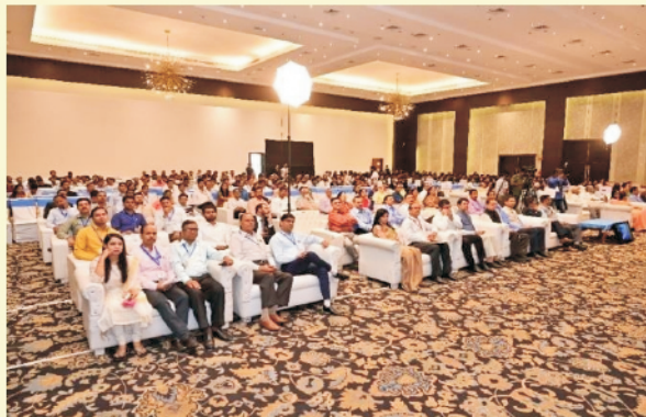
Delegates and Participants attending the Seminar