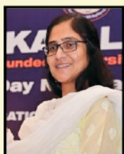
Smt. Shuchi Tyagi (IAS), Commissioner College Education of Rajasthan

The University is committed to imparting state of the art legal education with a strong foregrounding of human values, capable of coping effectively with the numerous paradigm shifts in the globalized world. In today's globalized network of interactions which permeate every aspect of civilization, educational institutions are under an obligation to develop such patterns and perspectives that can meet the needs and expectations of the present and also of the coming generations.