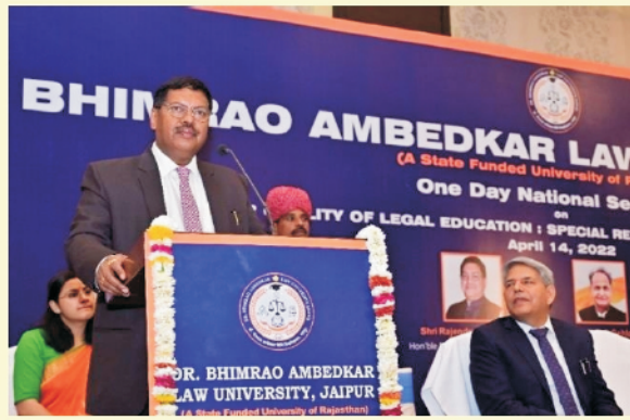
Justice Bhushan R. Gavai (Judge, Supreme Court of India) delivering his Inaugural Address.