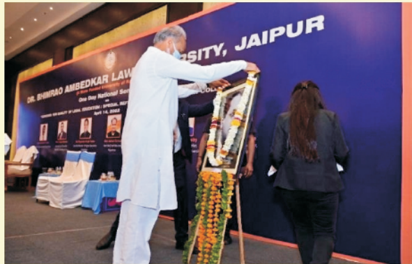
Shri Ashok Gehlot, Hon'ble Chief Minister of Rajasthan, offering Floral Tribute to Dr. Bhimrao Ambedkar.