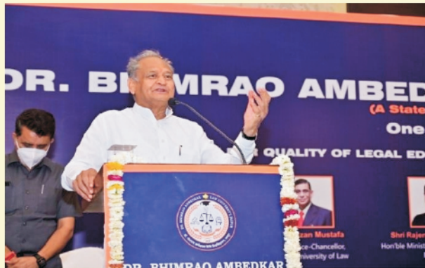
Sh. Ashok Gehlot, Chief Minister of Rajasthan addressing the audience.